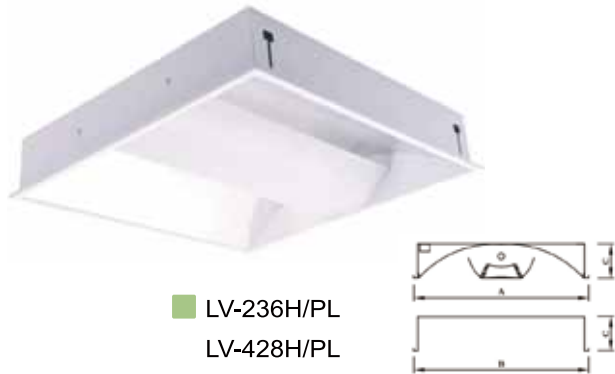
■ LV-236H/PL LV-428H/PL